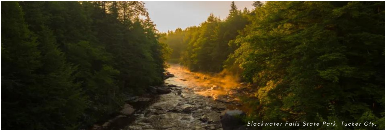
Blackwater Falls State Park, Tucker Cty.