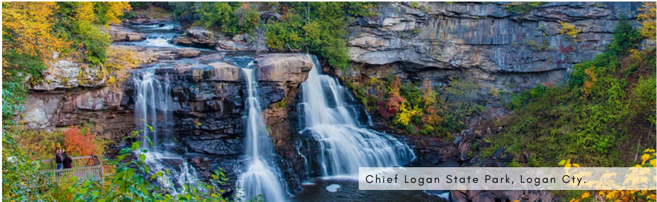
Chief Logan State Park, Logan Cty.