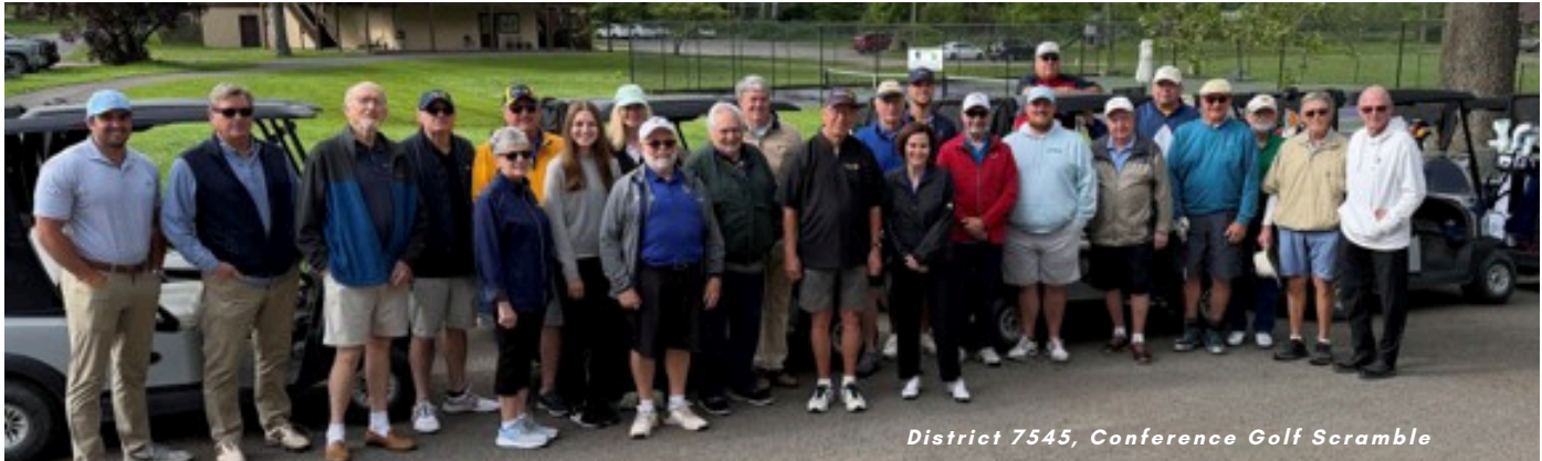
District 7545, Conference Golf Scramble